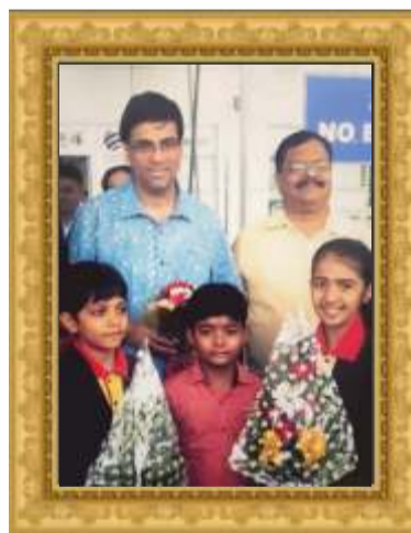
Grand Click with Grand Master Viswanathan Anand