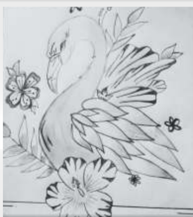
Prarthi Padhiyar 10th A