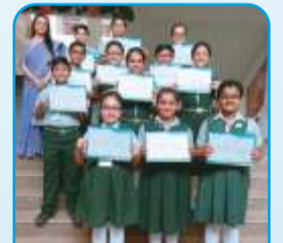
MONO ACTING COMPETITION