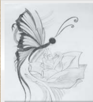
Purva Chaudhari 7th B