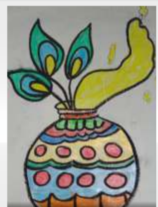
Jiyant Soni 4th B