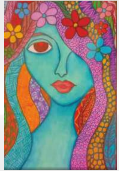
Shreeja Raval 9th A