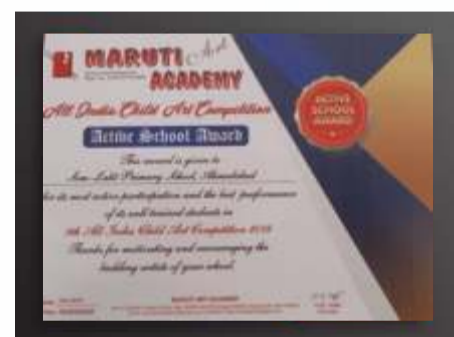
Most Active Participation & Performance