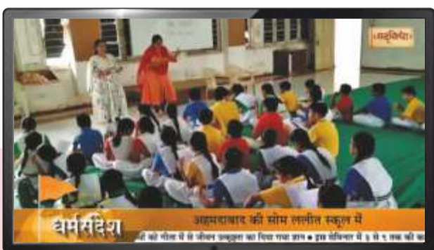
Coverage on Sadvidhya Channel