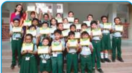
FANCY DRESS COMPETITION