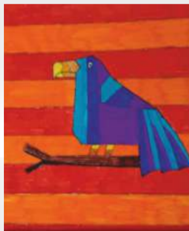
Ayush Jain 7th B