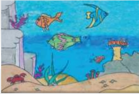
Hiya Lashkari 7th B 2