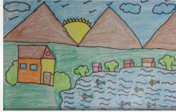
Riya Nagar 4th C