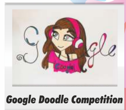
Google Doodle Competition