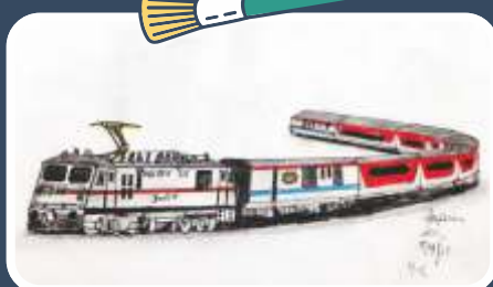
Arjun 4 C