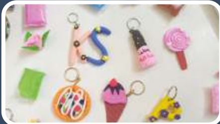
Class Work - Education