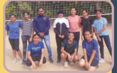
Volley Ball Girls Team @ Khel MahaKumbh