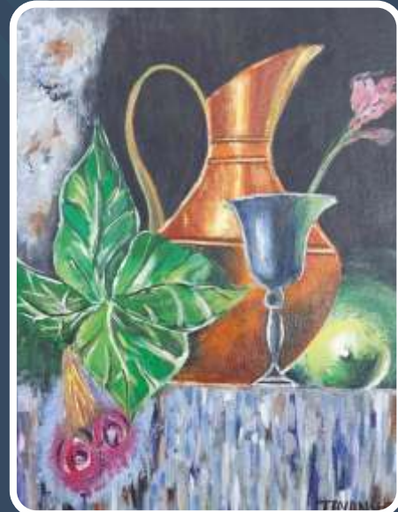
Jayanshi Badmera 9 B