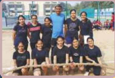
Tug Of War Girls Team Khel Mahakumbh Runners Up