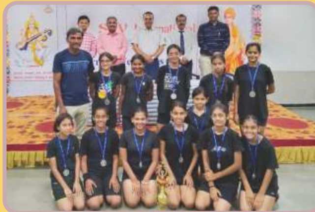
U-19 Girls Kho Kho Team @ CBSE Cluster Tournament Selected for National Level