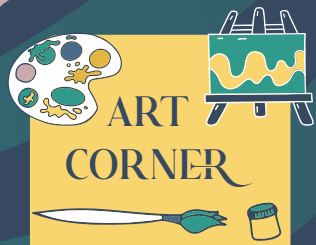
Zainab Rangwala 5 C