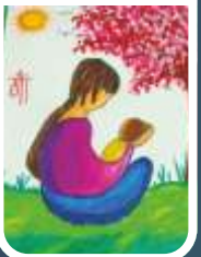
Twisha Soni 8 B