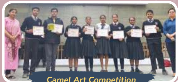
Camel Art Competition