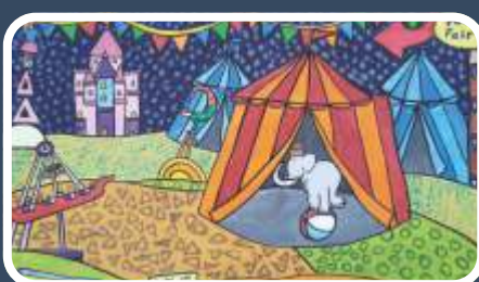
Kavish Panchal 4 B