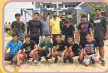
U-19 SGFI District Level Winners Handball Boys Team