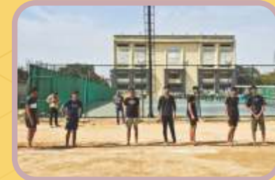
Tug Of War Boys Team Khel Mahakumbh Runners Up