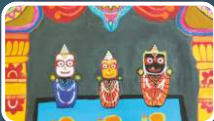
Trisha 5 C