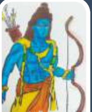
Divye Agrawal 3 B